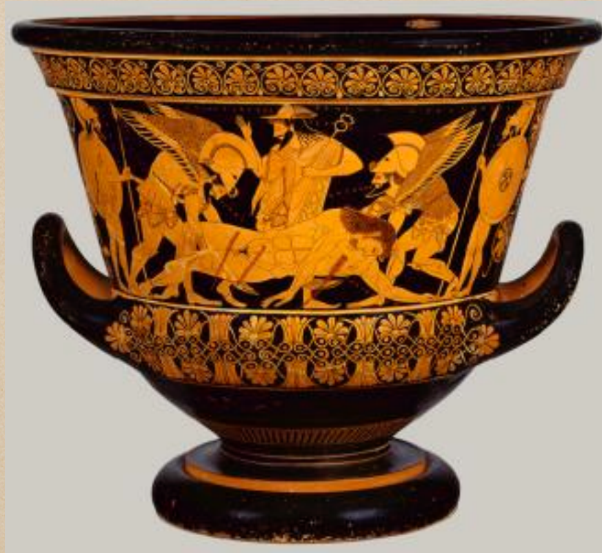
Athenian Red Figure Pottery c.350 BC